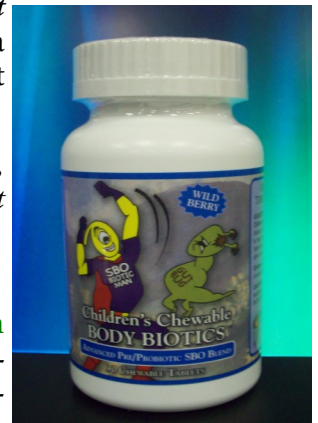
CHILDREN'S CHEWABLE BODY BIOTICS™ Advanced SBO Probiotics Consortia